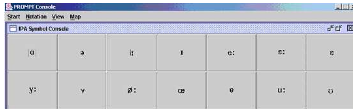
Figure 3: User Interface Generation (selection)

The symbols used have an underlying IPA-Unicode representation, however a notation transducer within the module allows for the mapping between a number of notation conventions (e.g. SAMPA, Wordbet, ARPAbet etc.). Any such mappings maintain the structural integrity of the phonological feature tree, namely symbols are mapped to their corresponding cognates as defined by the transducer, user defined feature associations are mapped to themselves. To summarise, the module provides a number of graphical interfaces for the following procedures: the graphical display of a phonological feature tree and all its nodes containing articulatory information as well as the language for which it is defined, graphical editing of the information contained within the trees – addition and deletion of nodes/tiers, modification of articulatory data. Any changes that have implications for DTDs (e.g. addition of an extra tier of information) are implemented automatically and selection of particular functions for the manipulation of the data contained within feature trees, e.g. the extraction of a language specific profile from the superset of all feature associations.